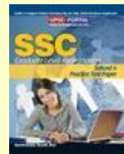
SSC: Solved And Practice Test Paper (Graduate Level Examination) Medium: English

Click Here For Book : http://sscportal.in/community/books